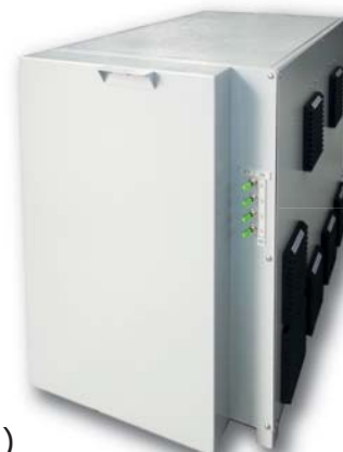
100A Power Booster