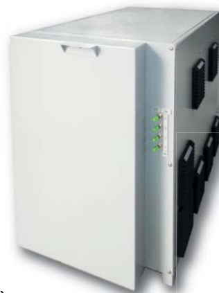
100A Power Booster